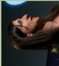
Maria Goeppert Mayer